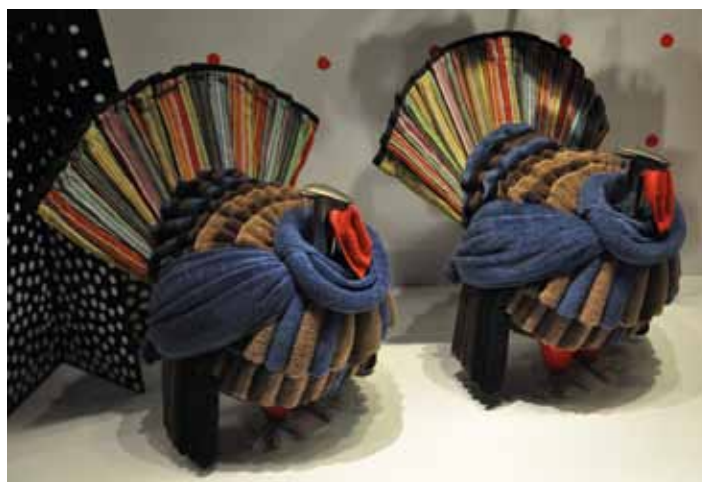
Peter Jones Window Christmas window decoration