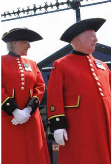
Chelsea Pensioners waiting for the prize-giving