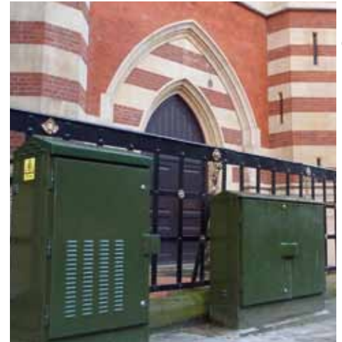
New broadband cabinet Grade II listed Holy Trinity Church, Sloane Street

present, an added ugliness. This is almost certainly the worst example of street clutter in Chelsea. Can anything be done? We shall see.