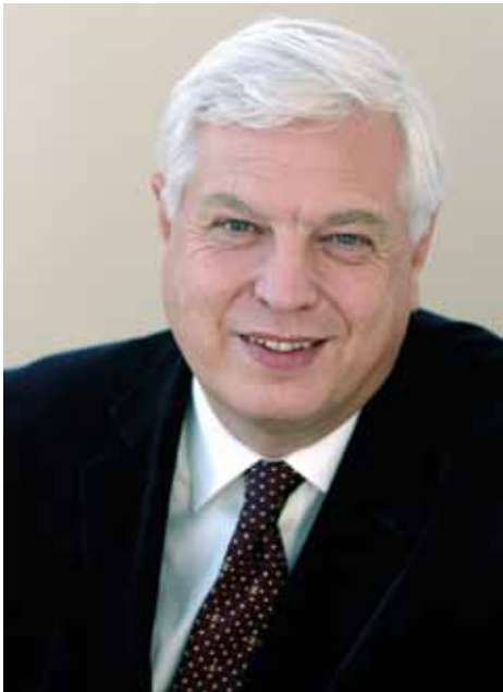
Our new President: John Simpson CBE

We are delighted to announce that John Simpson CBE, the BBC world affairs editor and writer, is to become the Chelsea Society's 13th President, succeeding Lord Salisbury who held the office for six years. John's family has long been part of Chelsea dating back to 1840 when his great-great grandfather ran the Queen's Head public house, which the Society helped save last year.