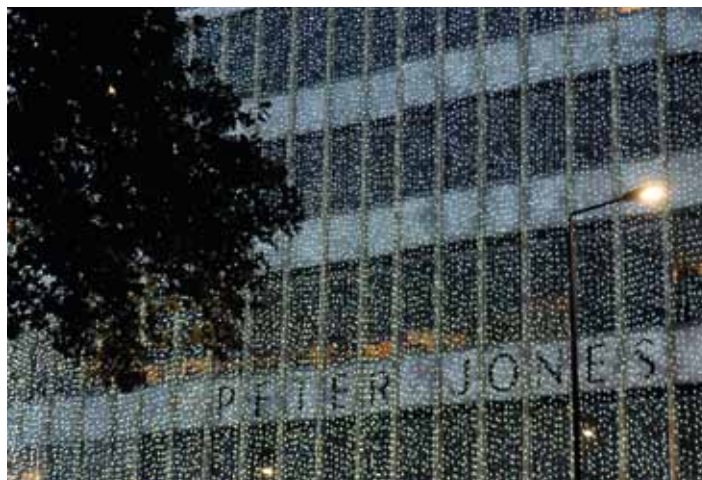
Peter Jones Christmas lights from Sloane Square