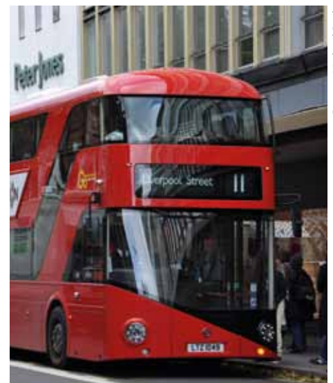
New Number 11 Boris Routemaster bus outside Peter Jones

we worry if passengers using the new buses have falls? Answer...only if they are more per mile than on conventional buses.