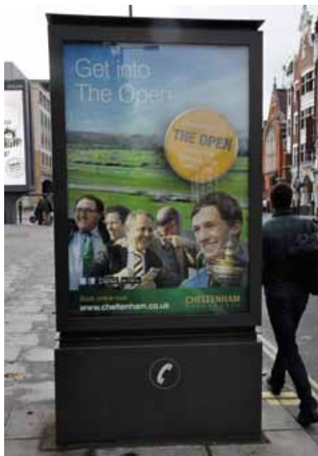
Advertphones, front and back