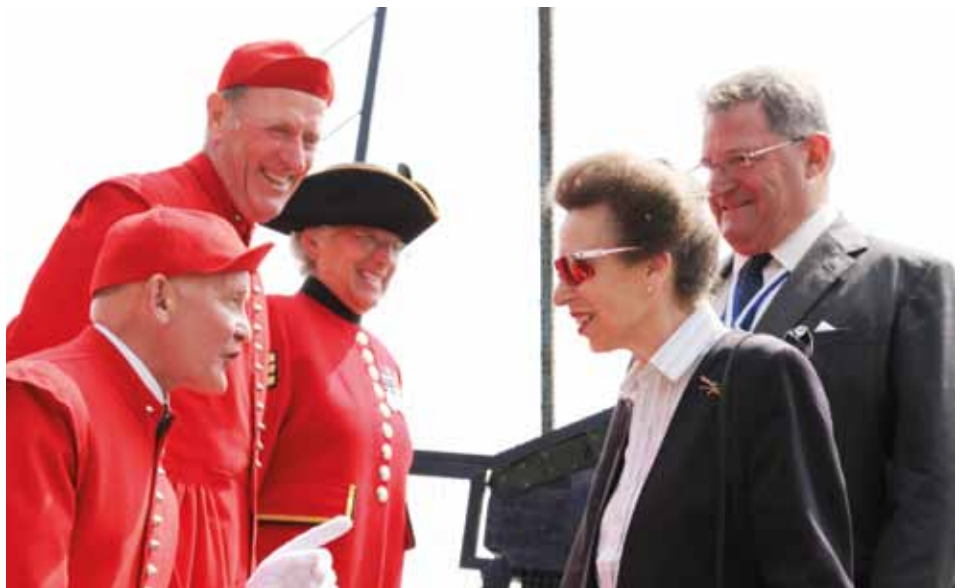
Watermen meeting HRH Princess Royal