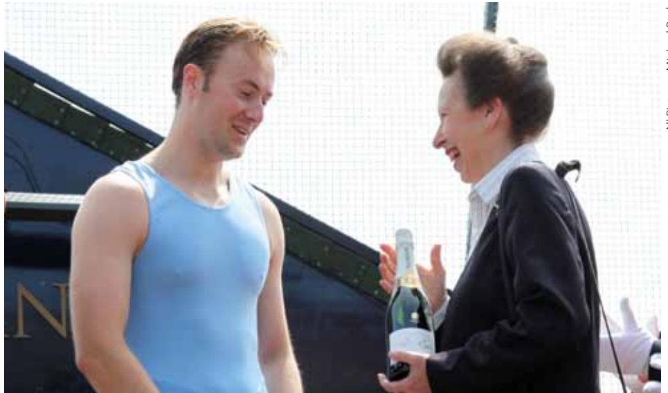
HRH Princess Royal presenting Champagne to the winner