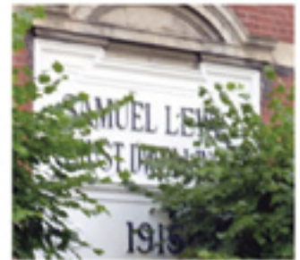
Lewis in Chelsea 1915