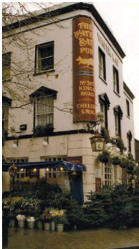
The Water Rat