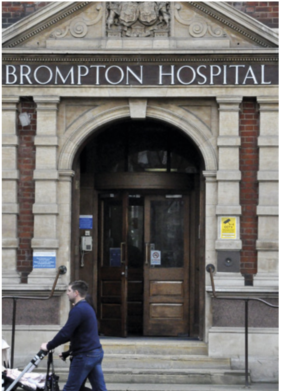
The Brompton - awaiting NHS report

Meanwhile the Mayor of London, concerned to capitalise on the city's reputation for medical excellence, has a committee looking at 'med-city', a campus