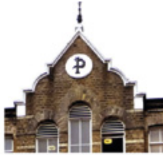
Peabody Trust in Chelsea 1870

The report will be available in the New Year.