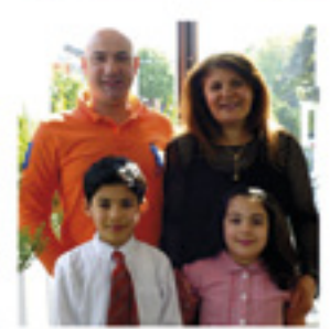
Local resident contributors