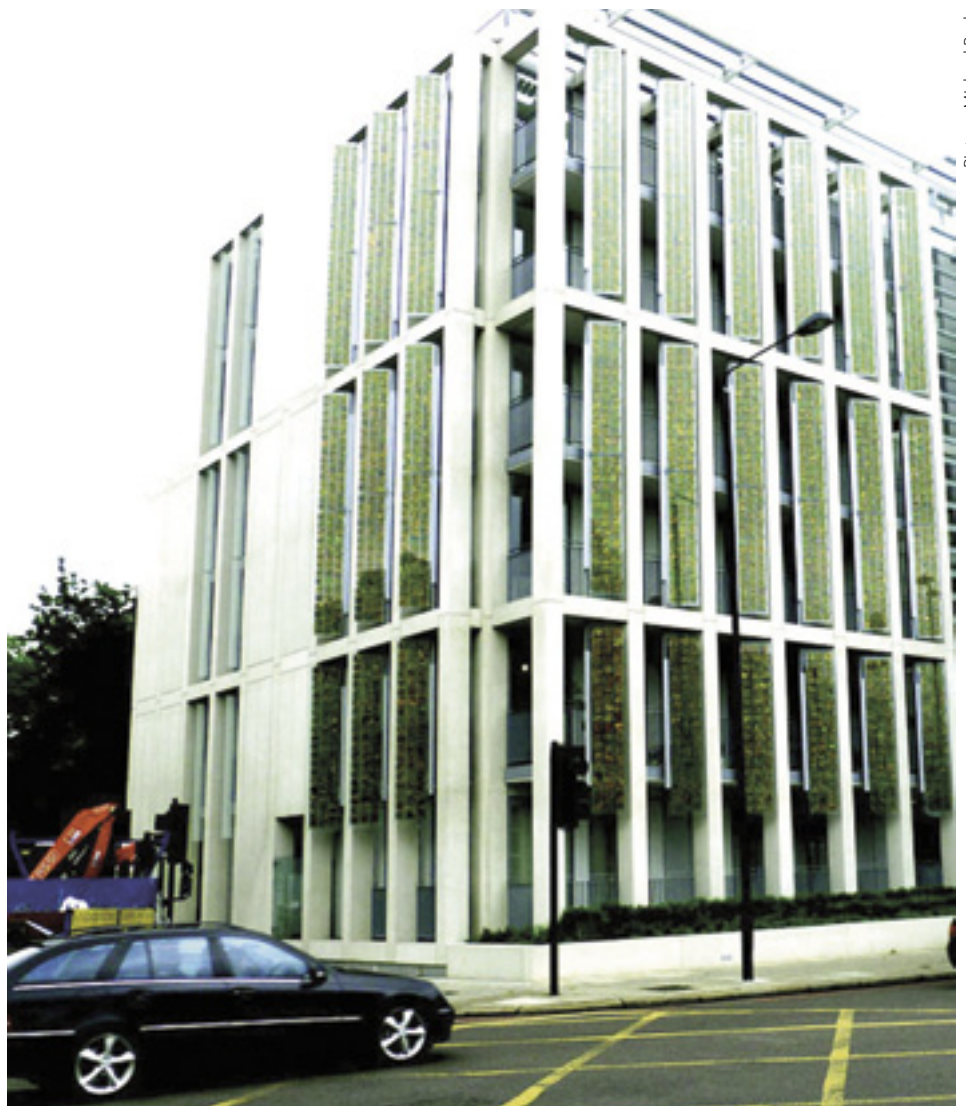
Kingsgate House - 'bloody brilliant'!