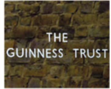
The Guinness Trust in Chelsea 1891